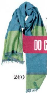
Mulu Shawl scarf, $195; lelem.com.

Threadsence.com Want to rock leather shorts, plaid shirts, or an ethnic-print maxidress? Shop this diverse mix of youth-oriented lines that sound a lot like band names (see Simdog and Urban Behavior). Bonus: Lots of sale items are less—sometimes far less—than $50. Reader perk! 20% off. Code: INSTYLE20