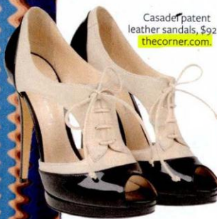
Casader patent leather sandals, $920; thecorner.com.