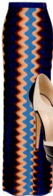
Missoni skirt, $890; thecorner.com.