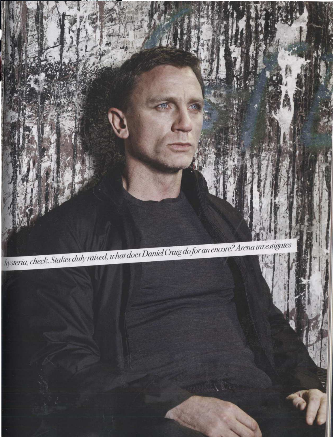
hysteria, check. Stakes duly raised, what does Daniel Craig do for an encore? Arena investigates