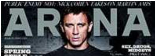
Daniel Craig wears Hussein Chalayan for YOOX.COM