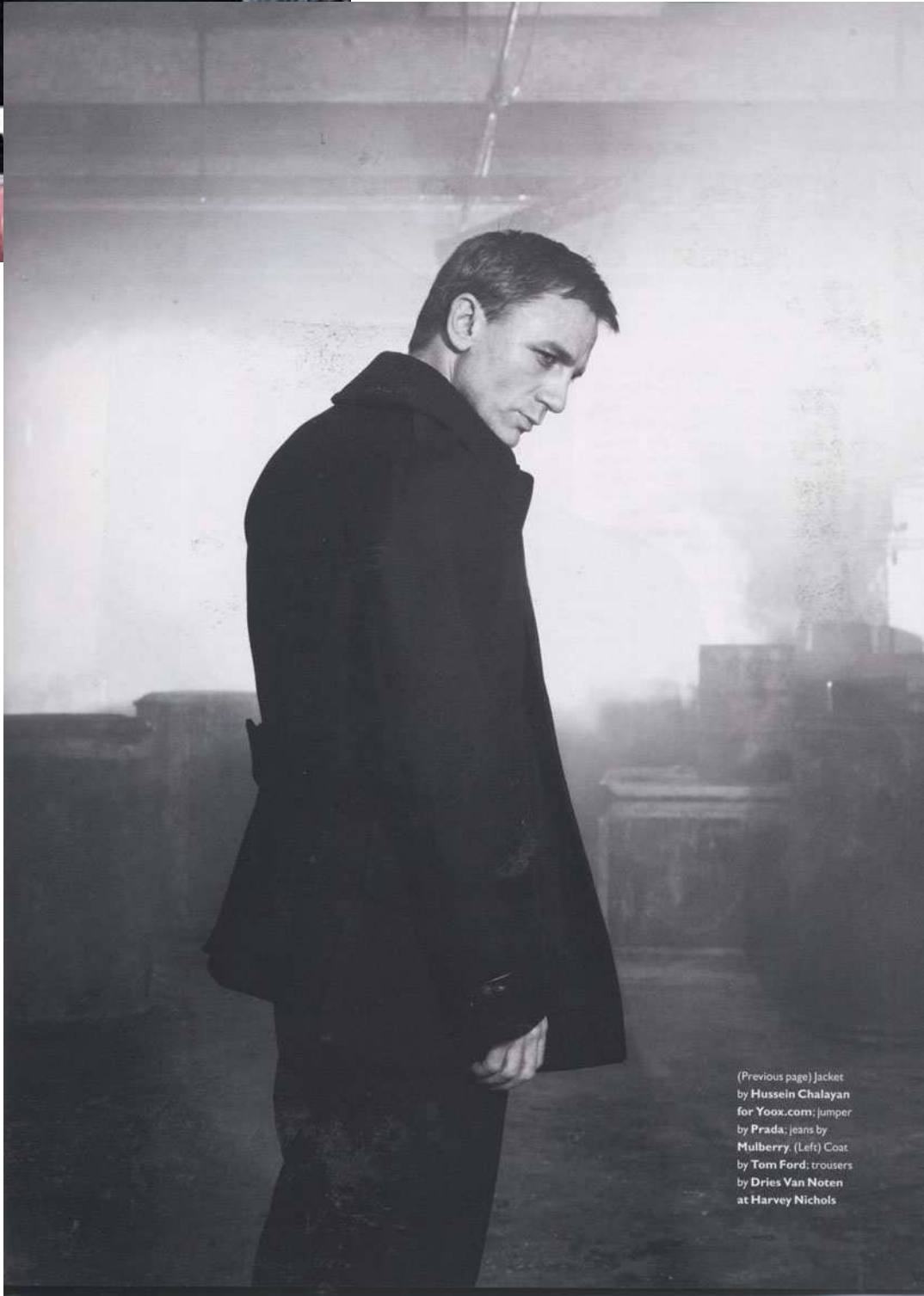
(Previous page) Jacket by Hussein Chalayan for Yoox.com; jumper by Prada; jeans by Mulberry. (Left) Coat by Tom Ford; trousers by Dries Van Noten at Harvey Nichols