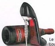
Le Rituel , by Christian Louboutin for Piper-Heidsieck