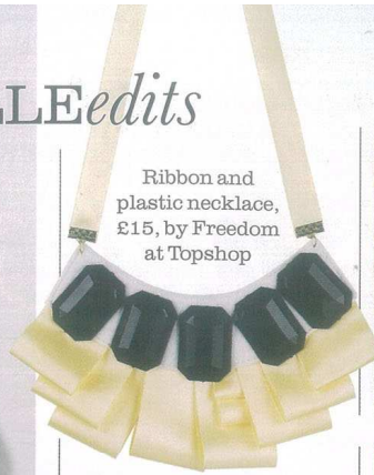
Ribbon and plastic necklace, £15, by Freedom at Topshop