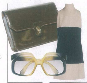
Leather bag, £725, and leather clutch, £450, both by Liberty of London

This month, LIBERTY OF LONDON is opening its first stand-alone store on Sloane Street. The contemporary new shop will showcase swimwear, jewellery, ACCESSORIES and menswear. Enq (020) 7573 9484; libertyoflondon.com