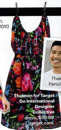
Thakoon for Target Go International Designer Collective dress, $39.99. target.com.