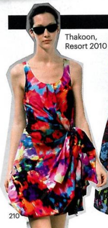
Thakoon, Resort 2010