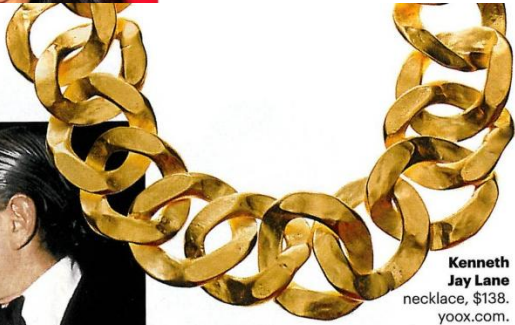
Kenneth Jay Lane necklace, $138. yoox.com.